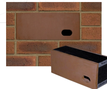
Ibstock Swift Eco Habitat