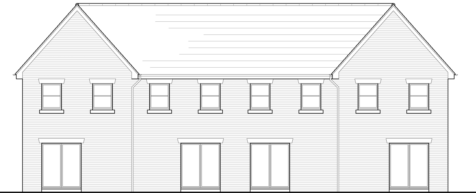
REAR ELEVATION (TERRACE OF 4)

Project No Drawing No Revision 28815 28815-P13-11 -