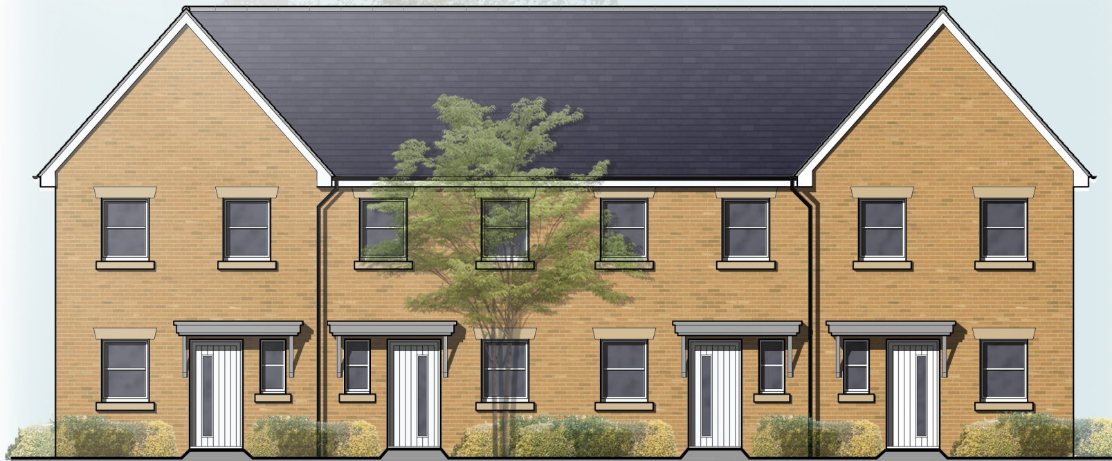
FRONT ELEVATION (TERRACE OF 4)