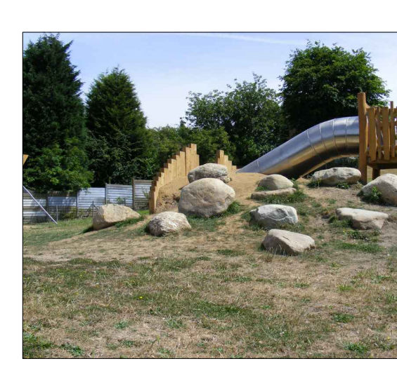
PE12 Boulders | Sizes: 900 mm x 600 mm x 600 mm Supplier: CED Natural stone or similar approved