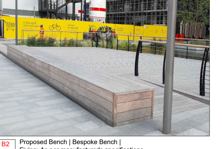
Proposed Bench | Bespoke Bench | Fixing: As per manufacturer's specifications For details ref. to drawing TRF-CBA-1-GF-M2-L-8300