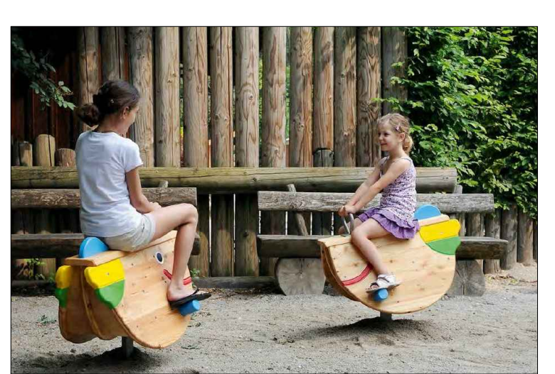
PE8 Little Chicken| Supplier: Timber Play | Product Code: 4.08100 Fixing: As per manufacturer's detail specifications