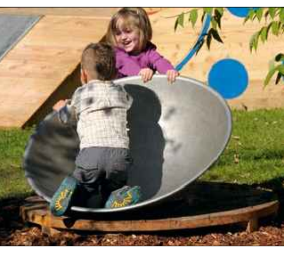
Wobble Dish | Supplier: Timber Play | Product Code: 6.27300 Fixing: As per manufacturer's detail specifications