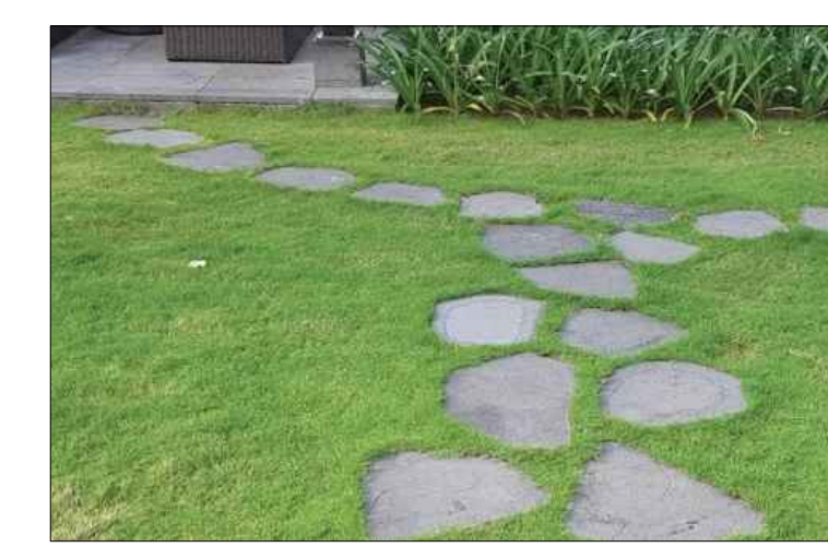
PE3 Stepping Stones | Granite | Varied shapes with min. size 0.9 x 0.9 m | Finish: Flamed | Colour: Beige |