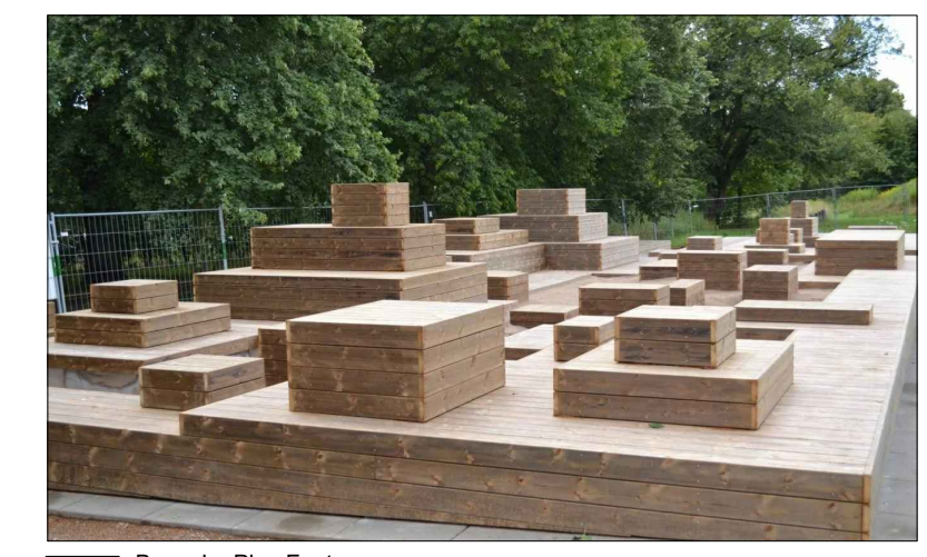
PE10 Bespoke Play Feature. For details ref. to drawing TRF-CBA-1-GF-M2-L-8301