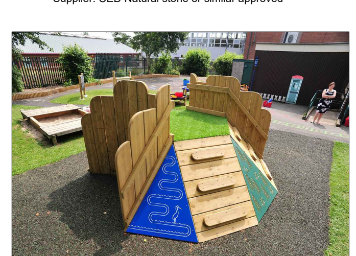
Mount Ridge Play Unit | Supplier: Hand Made Places | Product Code: BX/HMP 250035 Fixing: As per manufacturer's detail specifications

This document should not be relied on or used in circumstances other than those for which it was prepared and for which Chris Blandford Associates was commissioned. Chris Blandford Associates accepts no responsibility for this document to any other party other than the person by whom it was commissioned.