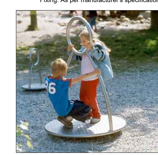
PE7 Large Spinner | Supplier: Timber Play | Product Code: 6.26402 Fixing: As per manufacturer's detail specifications