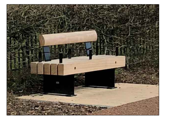
Proposed Bench | Tiptree Seat | Supplier: Broxap | Product Code: BX14 4030-BP | Galvanized steel legs with treated softwood | Finish: Black powder coated for metal members & arm rests| Fixing: Root fixed as per manufacturer's specifications