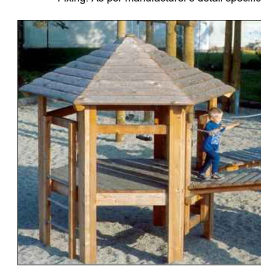
PE9 Small Hexagonal Hut with roof | Supplier: Timber Play | Product Code: 3.15300 Fixing: As per manufacturer's detail specifications