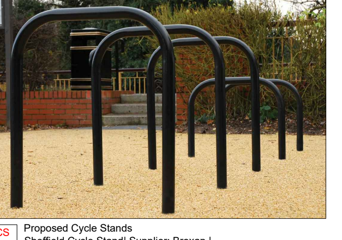
Proposed Cycle Stands Sheffield Cycle Stand| Supplier: Broxap | Product Code: BXMW/GS/Sheffield-Stand | Finish: Galvanized steel Black powder coated | Fixing: Root fixed as per manufacturer's specifications