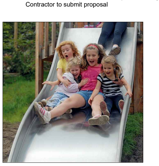
PE4 Slide | Stainless Steel | 3500 L x 1500 W x 1800 + 550mm H Attached at top and bottom with mounting plates Product: 3.64210 | Supplier: Richter Spielgeräte GmbH Fixed to manufacturer's recommendation