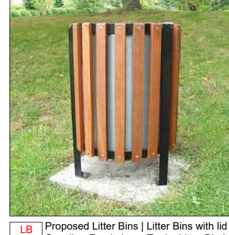
LB Proposed Litter Bins | Litter Bins with lid Supplier: Furnitubes - Tenby Litter Bin | Product Code: TSL 231 Dimensions: 530(ø) x 750 (H) | Fixing: Root fixed as per manufacturer's detail specifications