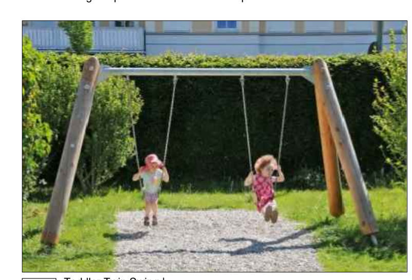
PE2 Toddler Twin Swing | Supplier: Timber Play | Product Code: 6.12720 Fixing: As per manufacturer's detail specification