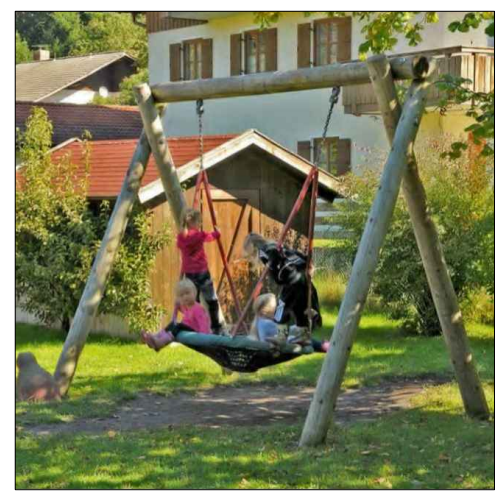
PE1 Cradle Nest Special | Supplier: Timber Play | Product Code: 6.14520 Fixing: As per manufacturer's detail specifications