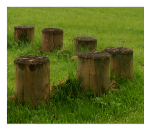
PE6 3 Stepping logs| Supplier: Timber Play | Product Codes: 6.82003; 6.82004; 682005; Fixing: As per manufacturer's specifications