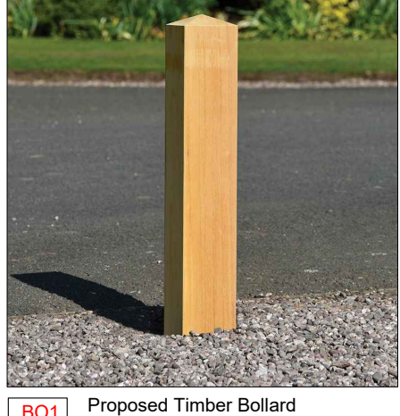
Proposed Timber Bollard Timber Bollard | Supplier: Broxap | Product Code: BX17 Pointed - Square Dimensions: 150x150mm x1000mm | Fixing: Fixed into concrete footing. Reflective bands in rebates. Granite setts surrounded.