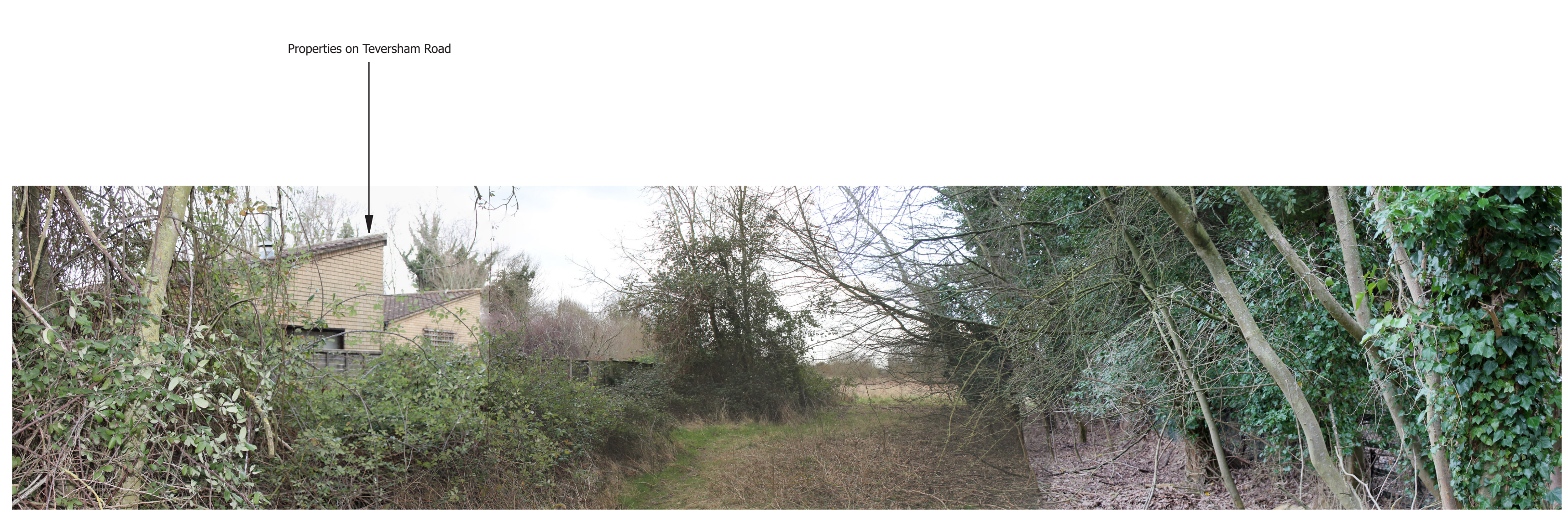
SITE APPRAISAL PHOTOGRAPH I: