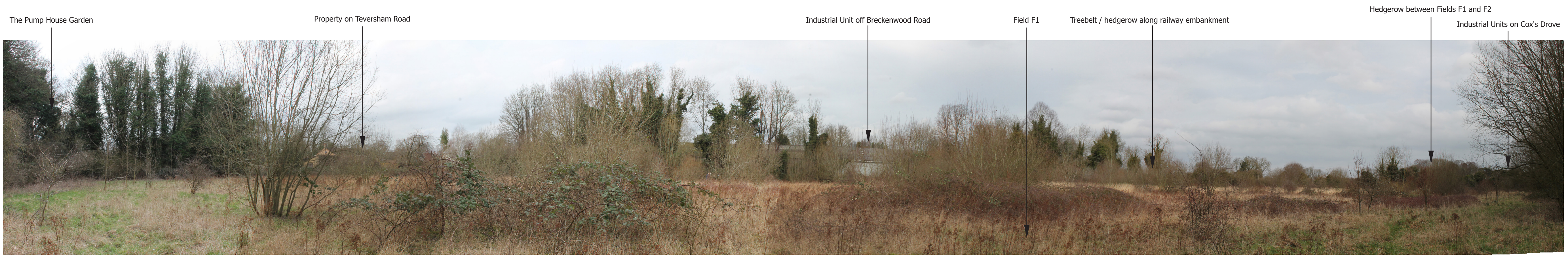
APPEAL SITE APPRAISAL PHOTOGRAPH F