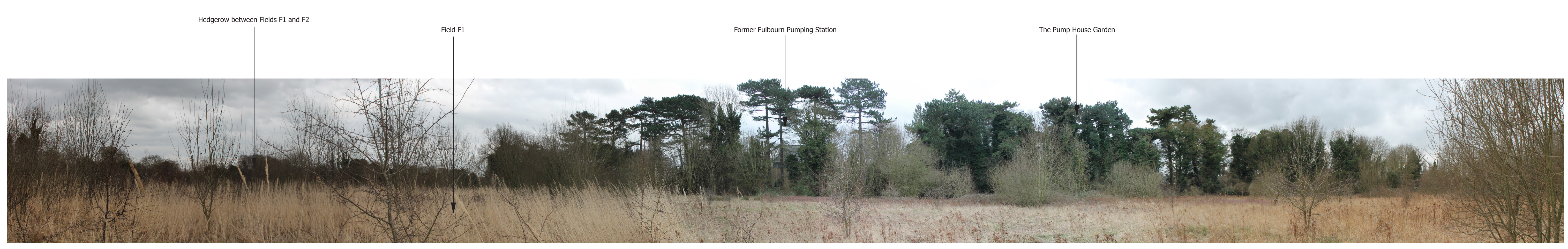
APPEAL SITE APPRAISAL PHOTOGRAPH G