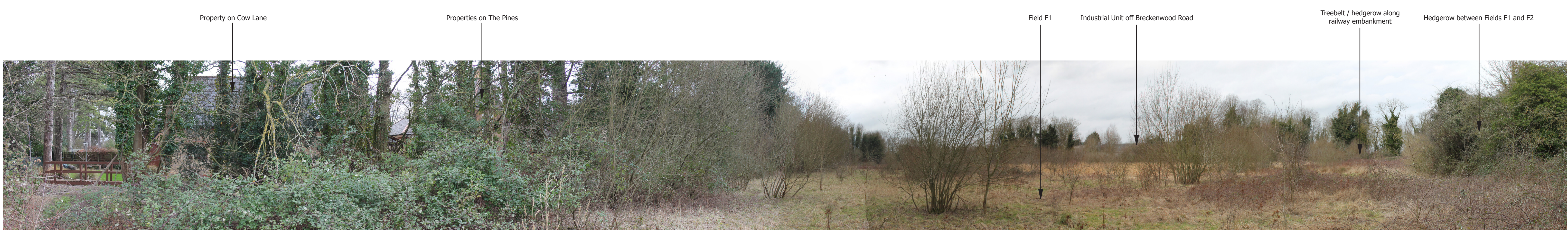
APPEAL SITE APPRAISAL PHOTOGRAPH E