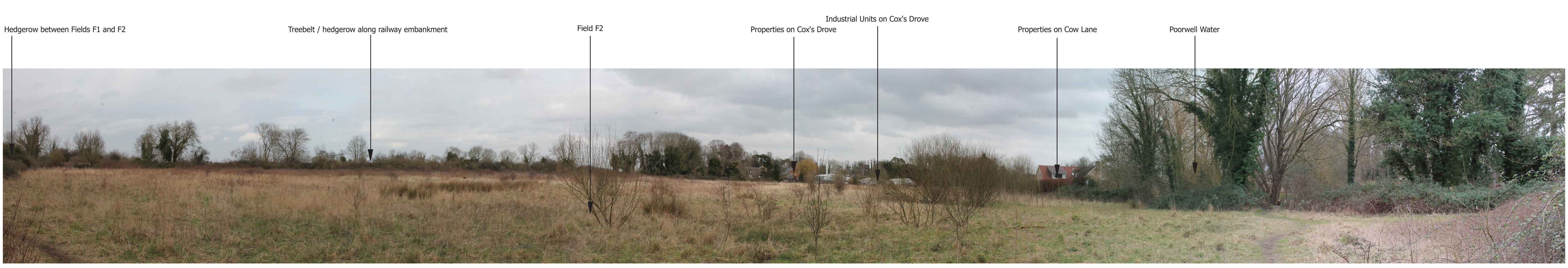
APPEAL SITE APPRAISAL PHOTOGRAPH D