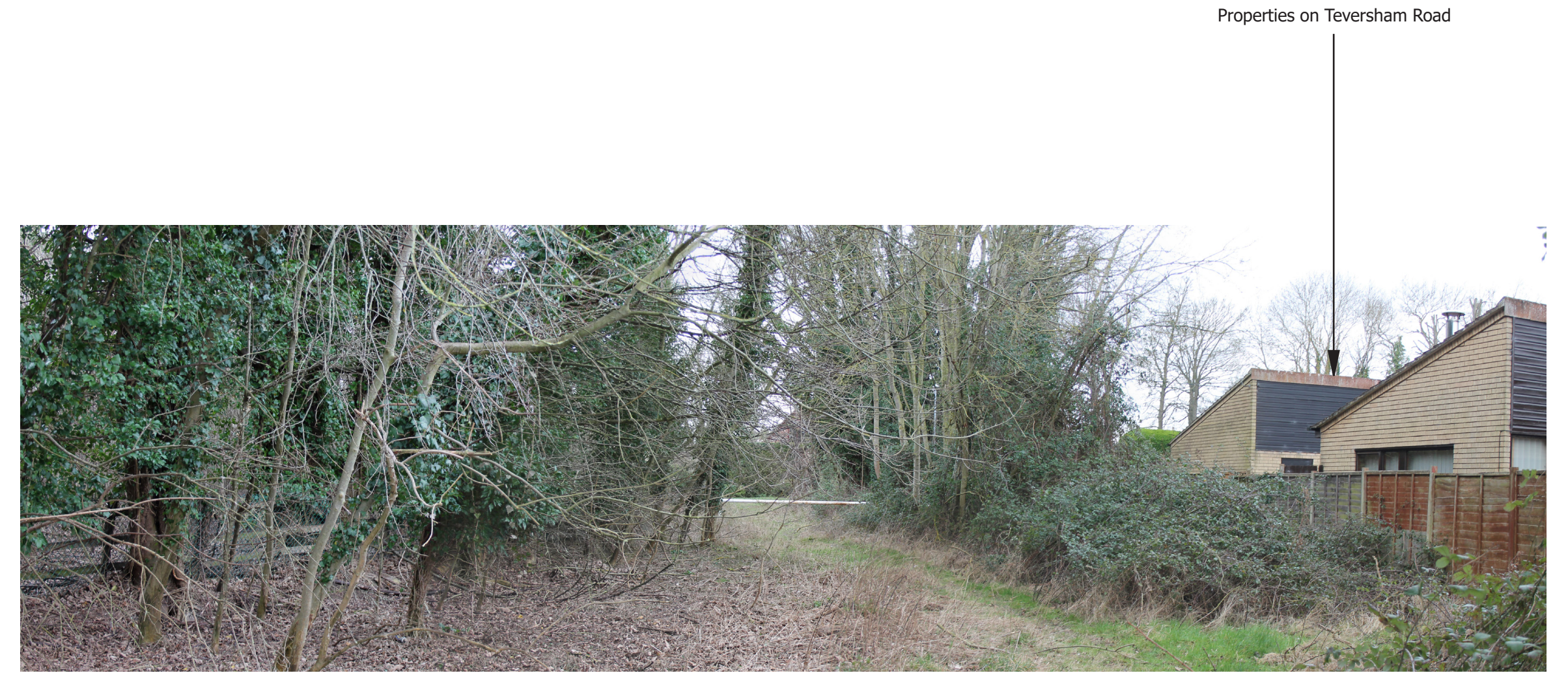
SITE APPRAISAL PHOTOGRAPH H: