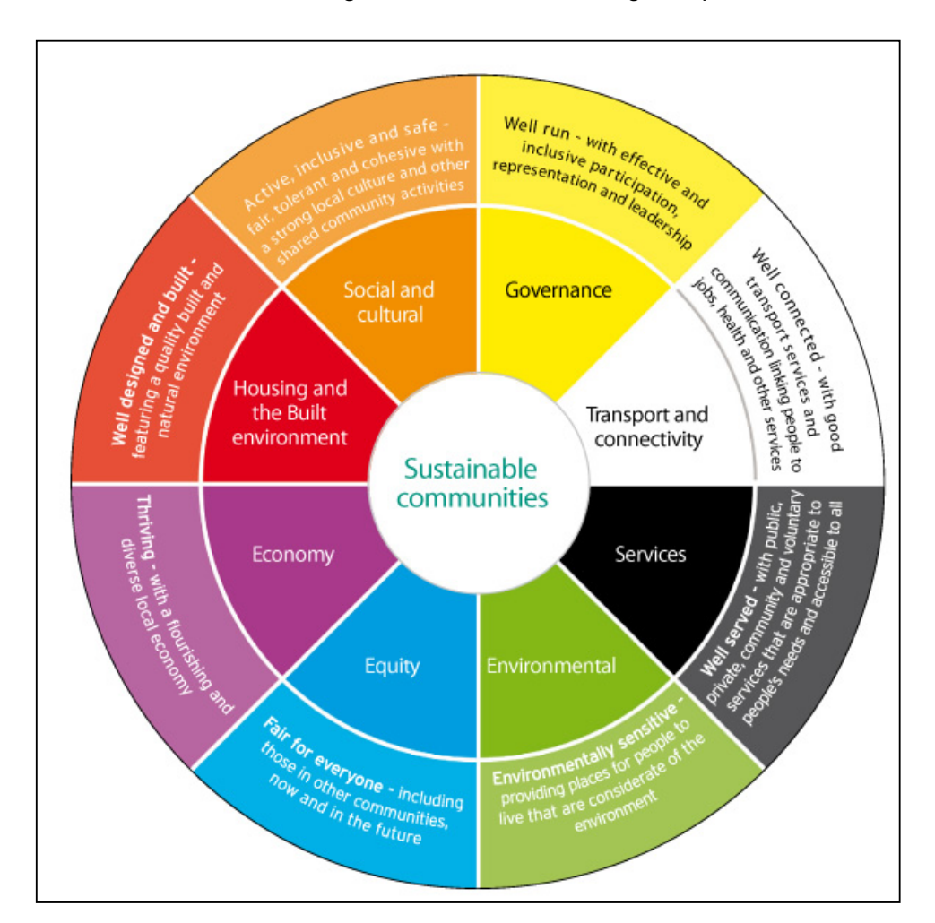
Figure 2: The Egan Wheel