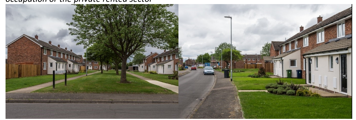
Cammell Walk, Waterbeach

Examples of former barracks accommodation which has been sold off and is now in owner occupation or the private rented sector